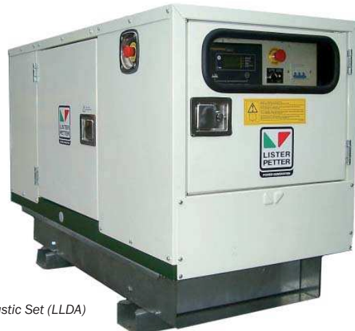
Acoustic Set (LLDA)