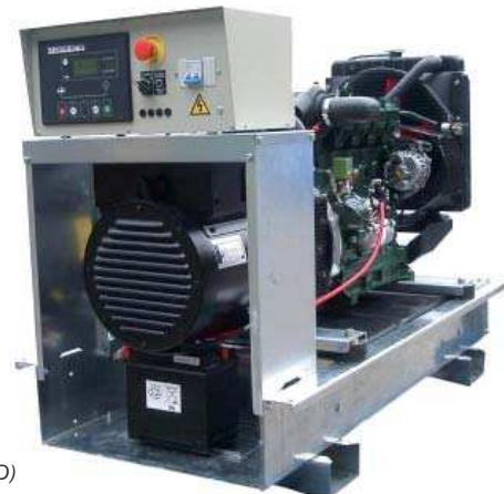
Open Set (LLD)