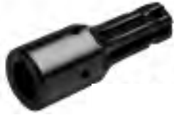
Spline Adapter (1-1/8" i.d. - 1-3/8" 6 spline)