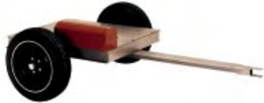
Off-road trailers (tool box not included)