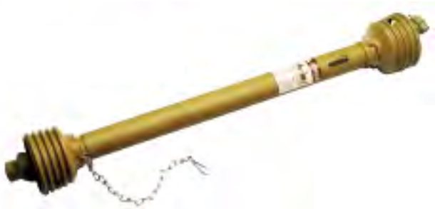
Tumbling Bar (for 540 rpm or 1000 rpm PTOs)