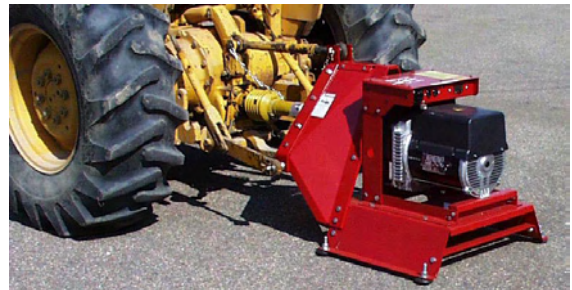
Three-point hitch, includes PTO shaft (for models W7PTOS, W11PTOS & W15PTOS)